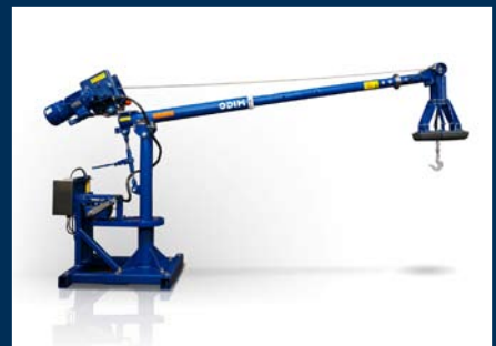
AUV LARS for Small Boats