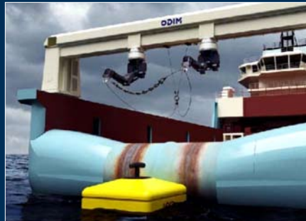
Remote Anchor Handling System