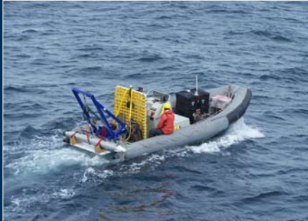
Towed Torpedo Emulator