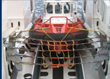
Stern Ramp for Work Boats and USVs