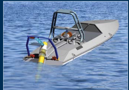
MiniAUV LARS for USV