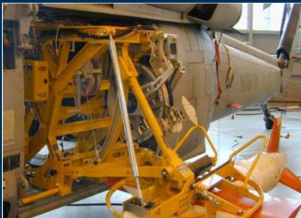
Helicopter-mounted Towbody LARS