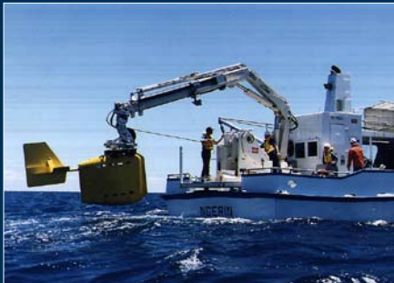
Containerized Handling System for Towed Acoustic Source