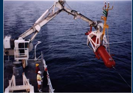
Semi-submersible USV LARS