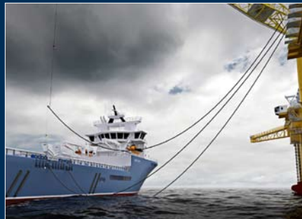
Automated Bulkhose Connection System